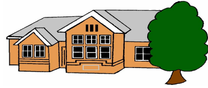
Cummersdale Primary School